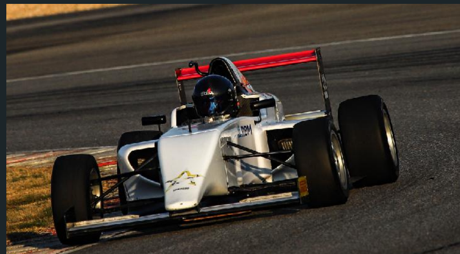
TATUUS FORMULA 4