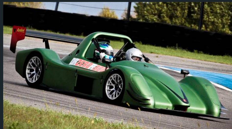
RADICAL SR3 Supersport