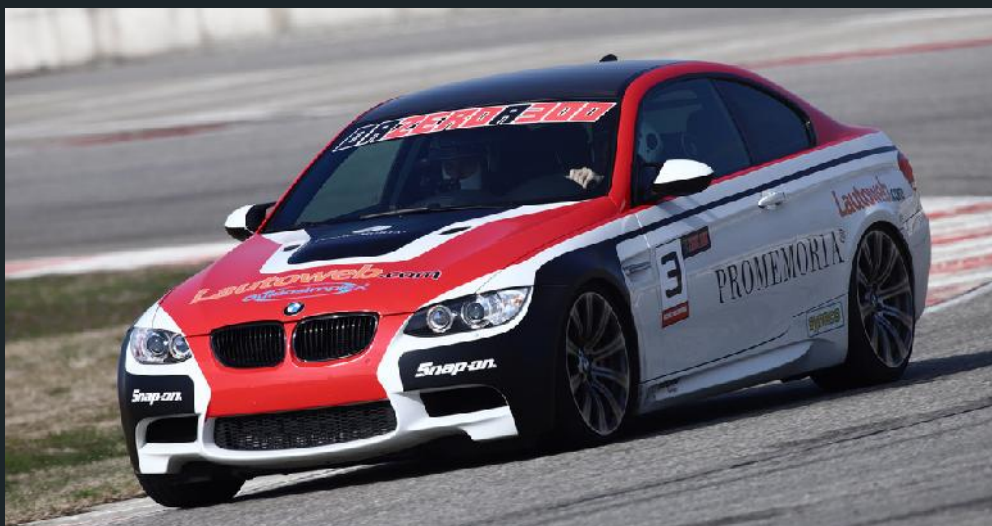
BMW M3 E92